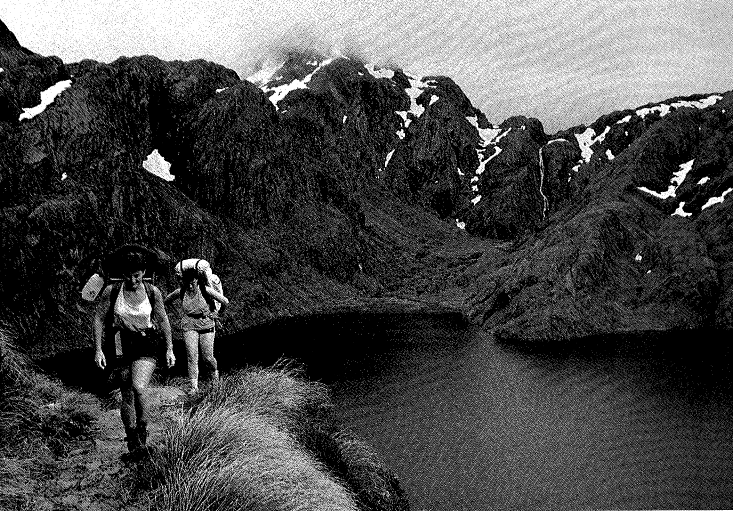
Routeburn walkers above Lake Harris