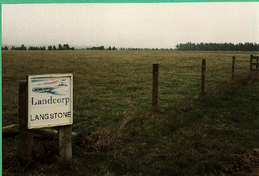
Eyrewell Station from Downs Road.