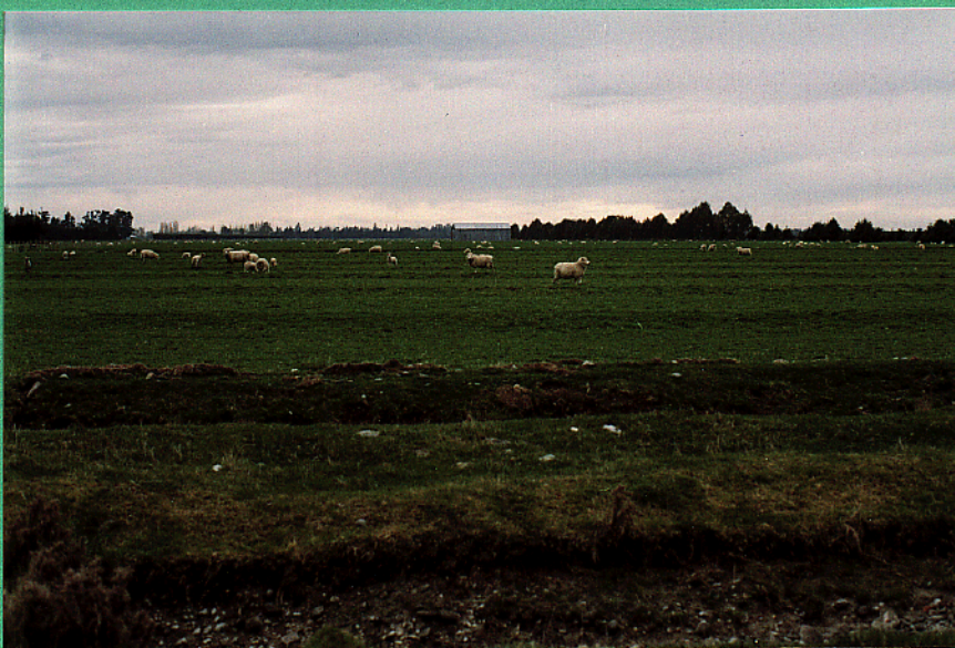
Part Ealing Pastures from Boltons Road.